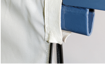
Optimal sealing design