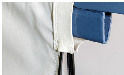
Optimal sealing design