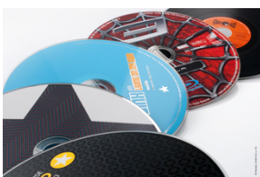
© Marabu GmbH & Co. KG