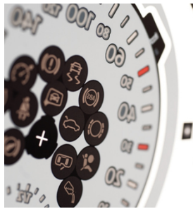
In the fast lane with the highest efficiency and quality printed with SEFAR PME