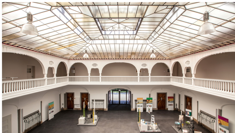
Sefar Competence & Training Center, Screen Printing

The intensive screen printing course covers a wide range of topics, from mesh selection and its impact on the print result, to the intricacies of the stretching process and how to optimize the printing process.