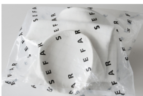
■ Tailor-made top connections (snap ring, steel ring)