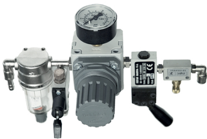
The simple control unit in combination with SEFAR 3A