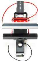
Jaw width 250 mm Stroke length 75 mm