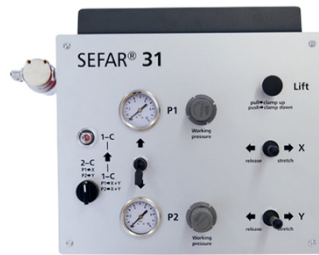
Universal, ergonomic and compact control unit in combination with SEFAR 3A