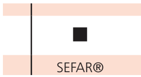
Standard Cyanoacrylate Selection Table

Sefar offers a range of private label cyanoacrylate adhesives for your shop with our SEFAR Mesh Adhesive line (SMA). The availability of low, medium and high viscosity adhesives insures a good match between adhesive and mesh specification. Use with Sefar’s standard activator product, SEFAR Activator.