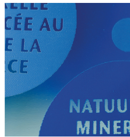
Brilliant colors and crisp print edges with UV inks. Printed with SEFAR PCF 120/305-34Y