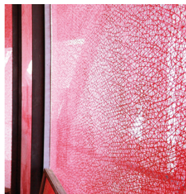
For a precise and durable print image on the glass facade with SEFAR GLASSLINE 68/175-95W