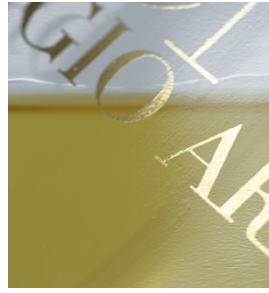
High dense sharp edged letters on parfume flacon with SEFAR PCF FC