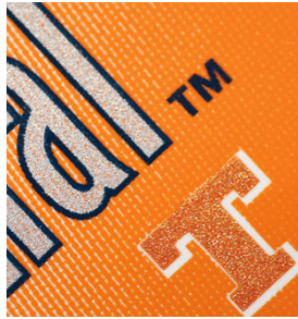
Sharp edged and well readable text on labels printed with SEFAR PCF FC