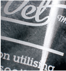
Outstanding printing quality of fine halftones on plastic tubes printed with SEFAR PCF FC