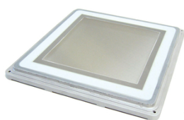
Trampoline Mounted Screen

As our stretched-screen customer, you will also have access to technical support that can help improve the quality of your printing, as well as help your shop push the envelope to take on more challenging projects, and be a technical resource if you should ever have questions.